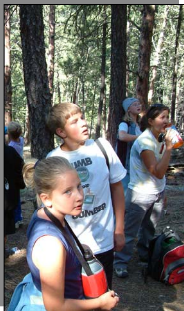
Fort Courage 2006