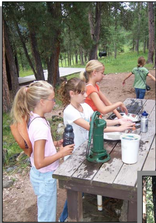
Fort Courage 2008

Fort Courage fee $350 Calvary Lutheran fee: $300