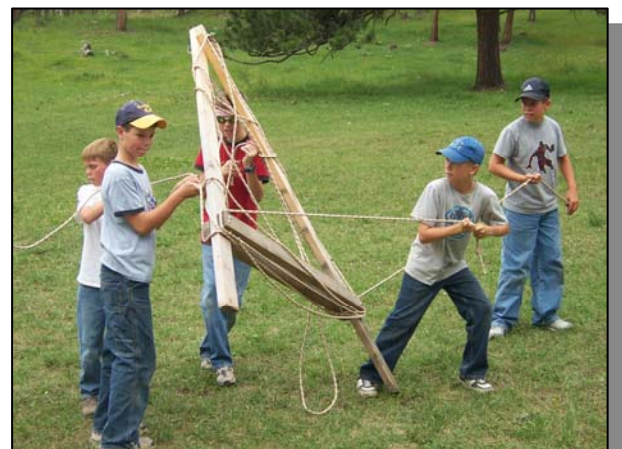
Fort Courage 2008