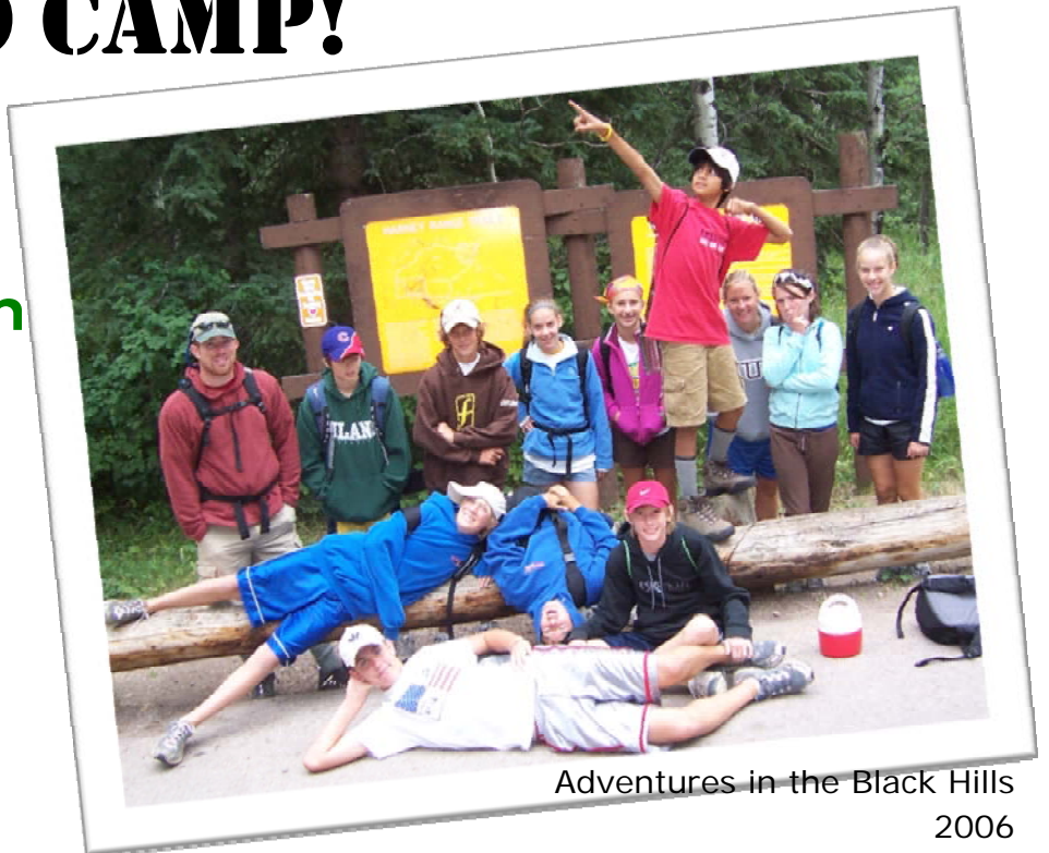
Adventures in the Black Hills 2006

Outlaw Ranch Fort Courage Atlantic Mt. Ranch Joy Ranch Klein Ranch NeSoDak