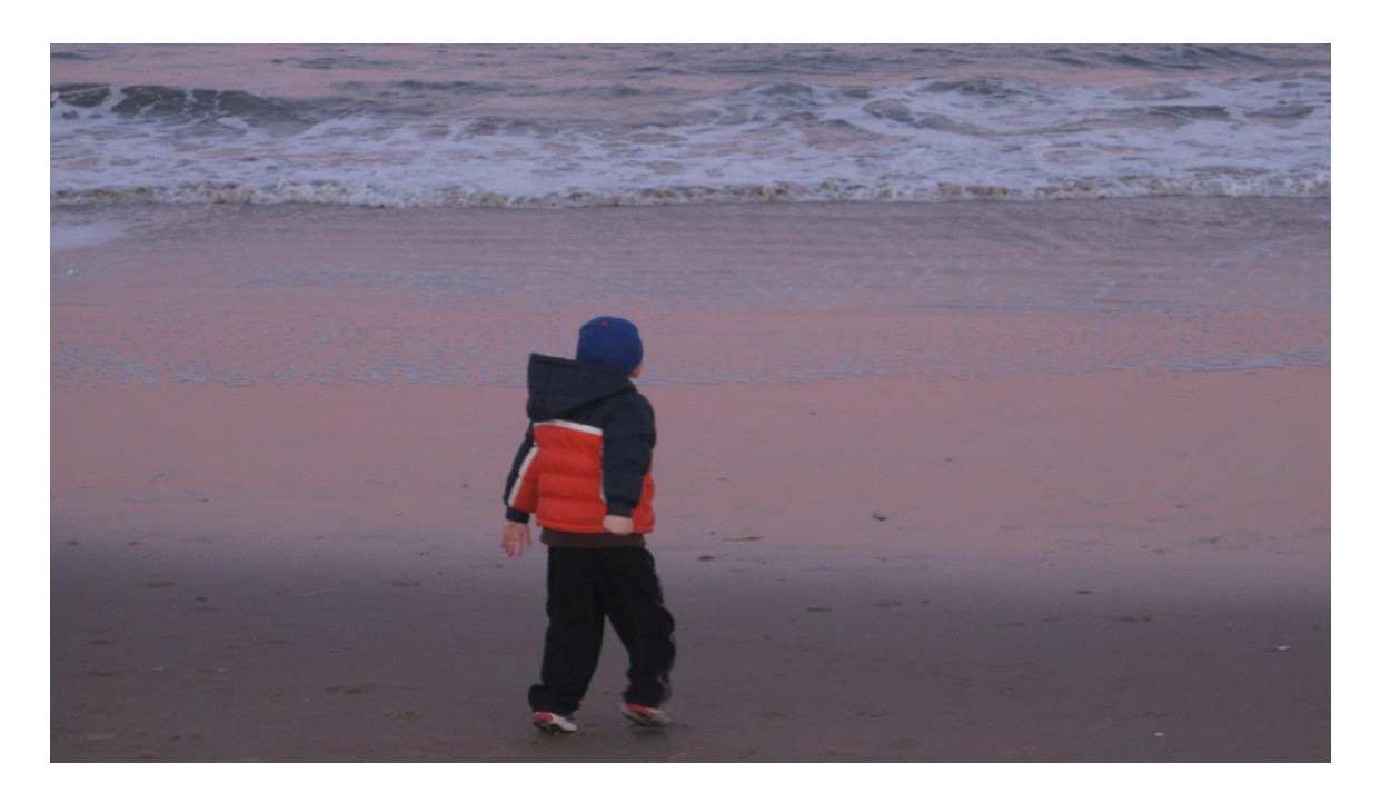
Sunset at Virginia Beach